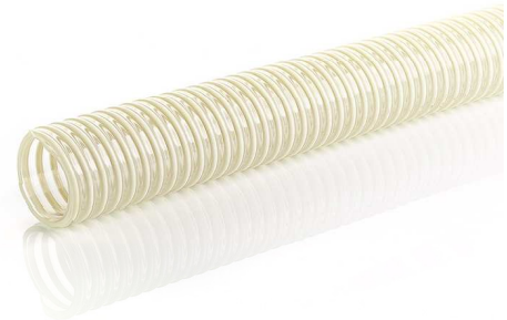
Appearance in reality may change