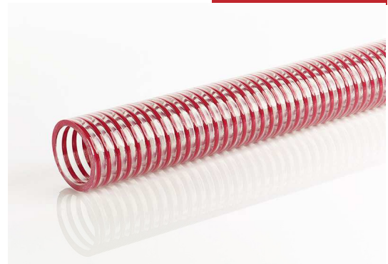
Appearance in reality may change