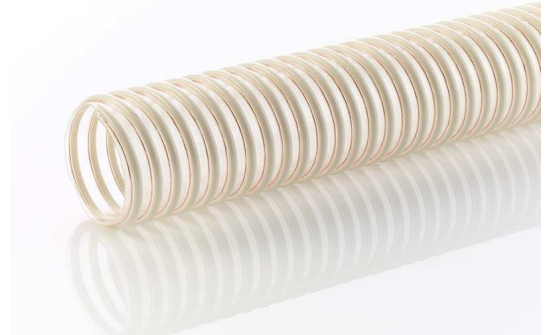
Appearance in reality may change