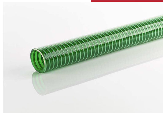
Appearance in reality may change