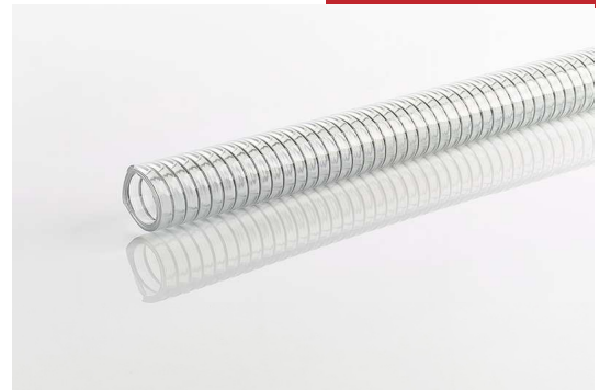
Appearance in reality may change