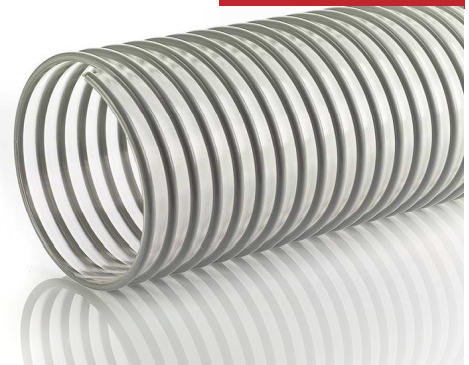
Appearance in reality may change