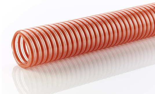
Appearance in reality may change