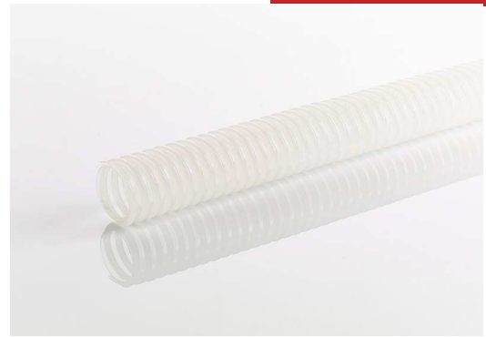
Appearance in reality may change