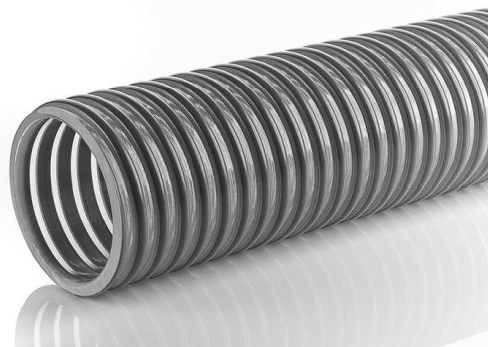
Appearance in reality may change