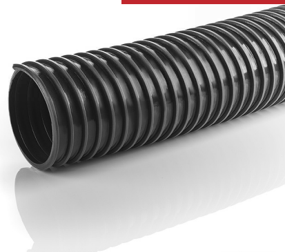
Appearance in reality may change